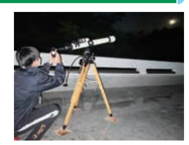
Astronomical observation with an astronomical telescope given to him by his uncle

The impact of this experience stayed with him and nurtured his interest in astrophysics, especially black holes. His interest was heightened by the news he heard in junior high school about the successful filming of a black hole.